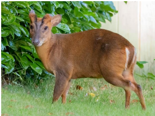
A young Muntjac Deer