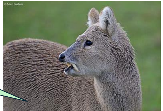
Chinese Water Deer

The Muntjac were imported into Woburn Park, Bedfordshire in the early 20 th century. Releases and escapes from Bedfordshire, Northamptonshire and Warwickshire led to the establishment of feral populations in England and Wales. Chinese Water Deer were first kept at London Zoo in 1873, and some escaped from Whipsnade Zoo in 1929. Although not as widespread as Muntjac as their preferred habitats include reed beds, river shores, woodlands and fields, they now account for about 10% of the world population.