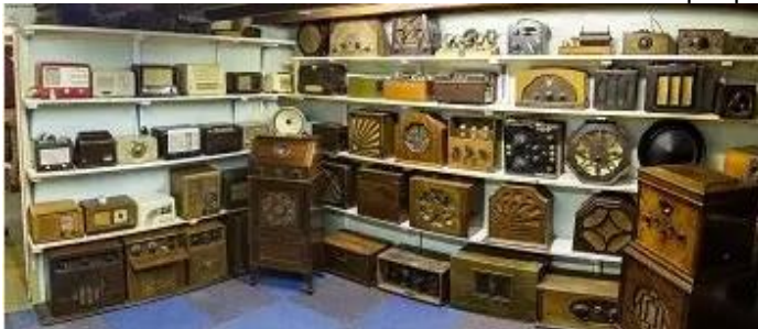
Part of the collection of old broadcast receivers at the British Vintage Wireless and Television Museum