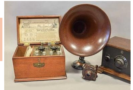
An early and rare 1920's wireless set

Early radios used valves (vacuum tubes) which, initially, were quite large and required both low voltage and high current to operate. The first portable radios were powered by lead-acid accumulators that had to be removed from the cabinet and recharged – not too practical.