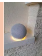
Amazon Alexa Echo Dot

In conclusion, did radio change the home? In the early days it most certainly did! The next major broadcasting event was, of course, Television. Did that change the home? – Most definitely, that one-eyed monster is everywhere. Radio is far less intrusive than TV and 50 million people across the UK listen every week – about 87% of the population.